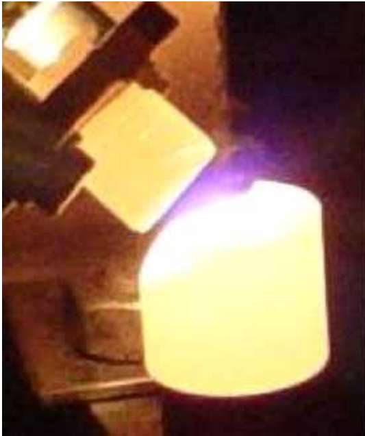
Figure 2: TVA Guna and Be plasma