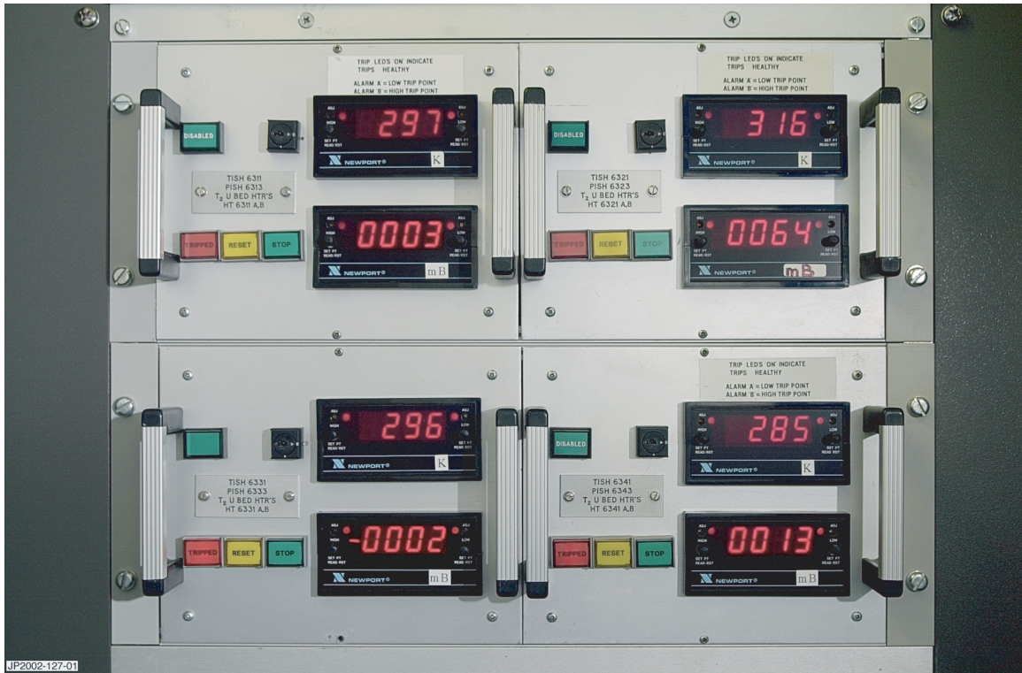
Figure 3: Uranium Storage Beds Hardwired Interlock Modules